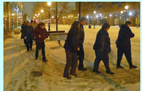
A cold walk in the snow!

Those members who attended the NFRCC 50th Convention reported that the speakers were excellent, and (despite the inclement weather and a miserable walk between the Convention Centre and the hotel), the weekend was a worthwhile experience.