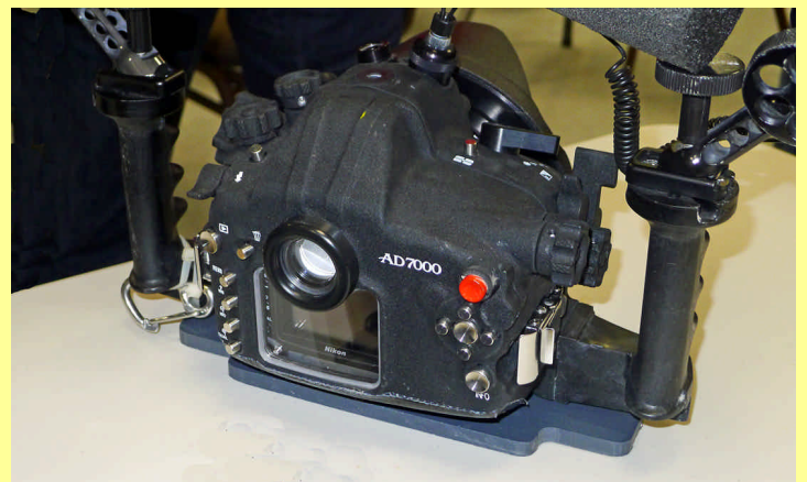
A typical underwater camera housing.

We have two presenters for this evening, Paul Walker and Kevin Smith. They are both avid scuba divers and underwater photographers. One of those times when two pastimes interact perfectly. The evening will include a display of the type of equipment they use (photo below shows some of their setup). It will also include a presentation of some of their work selected from diving locations both here in Canada and also in some very exotic locations. You'll be tempted to go out and get your scuba diving certification after this program!